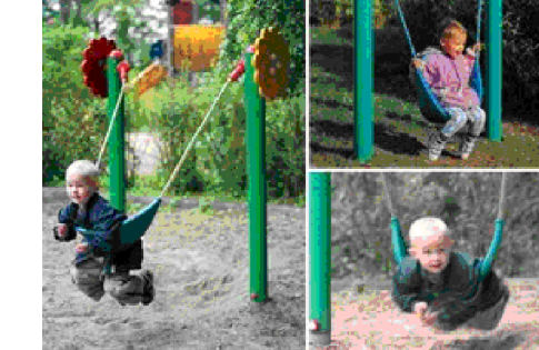
JUNIOR SWING UNIT WITH FLEXIBLE SEAT